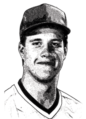
JIM ABBOTT University of Michigan 1987 GSA Winner 1988 Olympic Gold Medalist