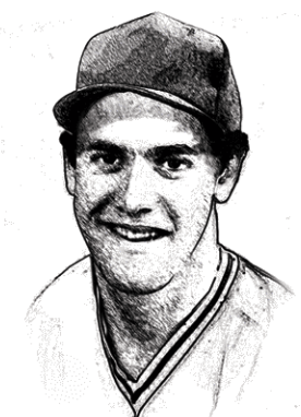
WILL CLARK Mississippi State University 1985 GSA Winner 6-Time MLB All-Star