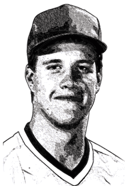
JIM ABBOTT University of Michigan 1987 GSA Winner 1988 Olympic Gold Medalist