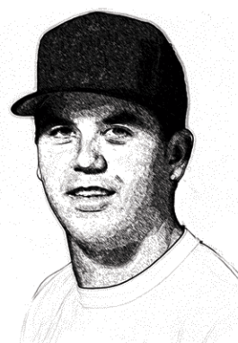
JASON VARITEK Georgia Tech 1994 GSA Winner 2-Time MLB All-Star