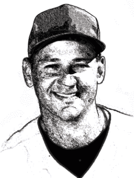
TERRY FRANCONA University of Arizona 1980 GSA Winner '04, '07 World Series Manager

For the past 30 years, USA Baseball has honored the top amateur baseball player in the country with the Golden Spikes Award. Following the first ever presentation of the Award to Bob Horner of Arizona State in 1978, the Golden Spikes Award has been presented each year to the player who exhibits exceptional athletic ability and exemplary sportsmanship. The 2007 Golden Spikes Award winner was David Price of Vanderbilt University. Past winners of this prestigious award include current Major League Baseball players such as Tim Lincecum ('06), Alex Gordon ('05), Rickie Weeks ('03), Khalil Greene ('02), Jason Jennings ('00), Pat Burrell ('98), J.D. Drew ('97), Mark Kotsay ('95), and Jason Varitek ('94). Former Major League stars that have captured the award include Robin Ventura ('88), Jim Abbott ('87), Will Clark ('85), Dave Magadan ('83), Terry Francona ('80), Tim Wallach ('79), and Bob Horner ('78).