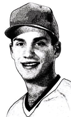
ROBIN VENTURA Oklahoma State University 1988 GSA Winner 6-Time Golden Glove Winner

For the past 30 years, USA Baseball has honored the top amateur baseball player in the country with the Golden Spikes Award. Following the first ever presentation of the Award to Bob Horner of Arizona State in 1978, the Golden Spikes Award has been presented each year to the player who exhibits exceptional athletic ability and exemplary sportsmanship. The 2007 Golden Spikes Award winner was David Price of Vanderbilt University. Past winners of this prestigious award include current Major League Baseball players such as Tim Lincecum ('06), Alex Gordon ('05), Rickie Weeks ('03), Khalil Greene ('02), Jason Jennings ('00), Pat Burrell ('98), J.D. Drew ('97), Mark Kotsay ('95), and Jason Varitek ('94). Former Major League stars that have captured the award include Robin Ventura ('88), Jim Abbott ('87), Will Clark ('85), Dave Magadan ('83), Terry Francona ('80), Tim Wallach ('79), and Bob Horner ('78).