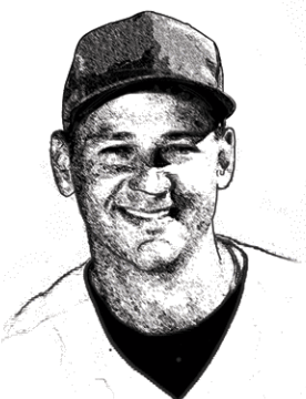
TERRY FRANCONA University of Arizona 1980 GSA Winner '04, '07 World Series Manager

A list of the 50 semifinalists is below.